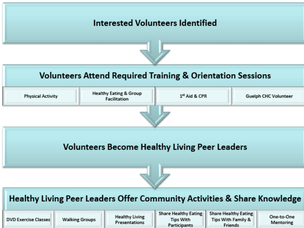
Figure 1: Healthy Living Peer Leader Project